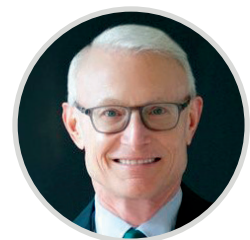
Michael E. Porter, PhD Editorial Board Co-Chair Bishop William Lawrence University Professor Harvard Business School

Editorial board includes health care executives, business school leaders, and clinical leaders.